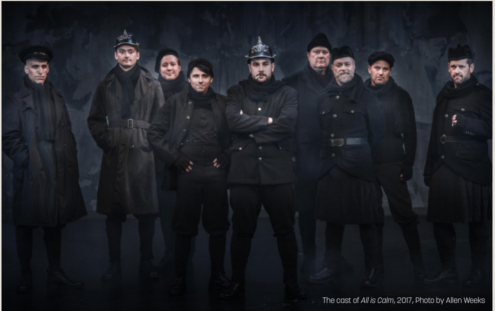
The cast of All is Calm , 2017

This remarkable story is told through the words of the great WWI poets, official war documents, diary entries and letters written by more than thirty WWI soldiers. The historic documents are woven together with iconic WWI songs and European Christmas carols to create a profound retelling of this extraordinary moment in history.